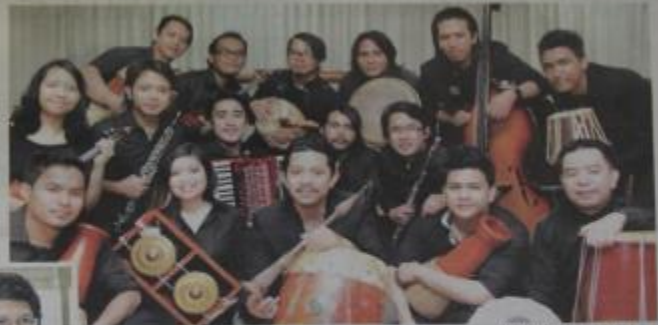
UiTM Performing Group (UJG).

There are the original 1100-1200 AD Malay traditional instruments that have been used in the past 100 years. The group will play at a concert supported by the UK Alumni Association in London.