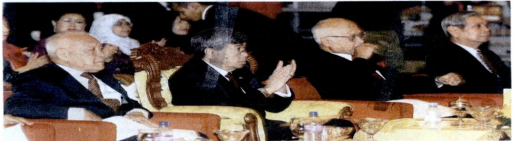
SULTAN Sharafuddin Idris Shah (dua dari kiri) berkenan berangkat pada konsert Jazztified di UITM Shah Alam, semalam.

Rasia Ensemble mengalunkan lagu medley Melayu termasuk lagu-lagu yang pernah dipopularkan oleh biduanita negara, Allahyarham Puan Sri Saloma seperti Kalau Berasmara dan Ketipang Payung .