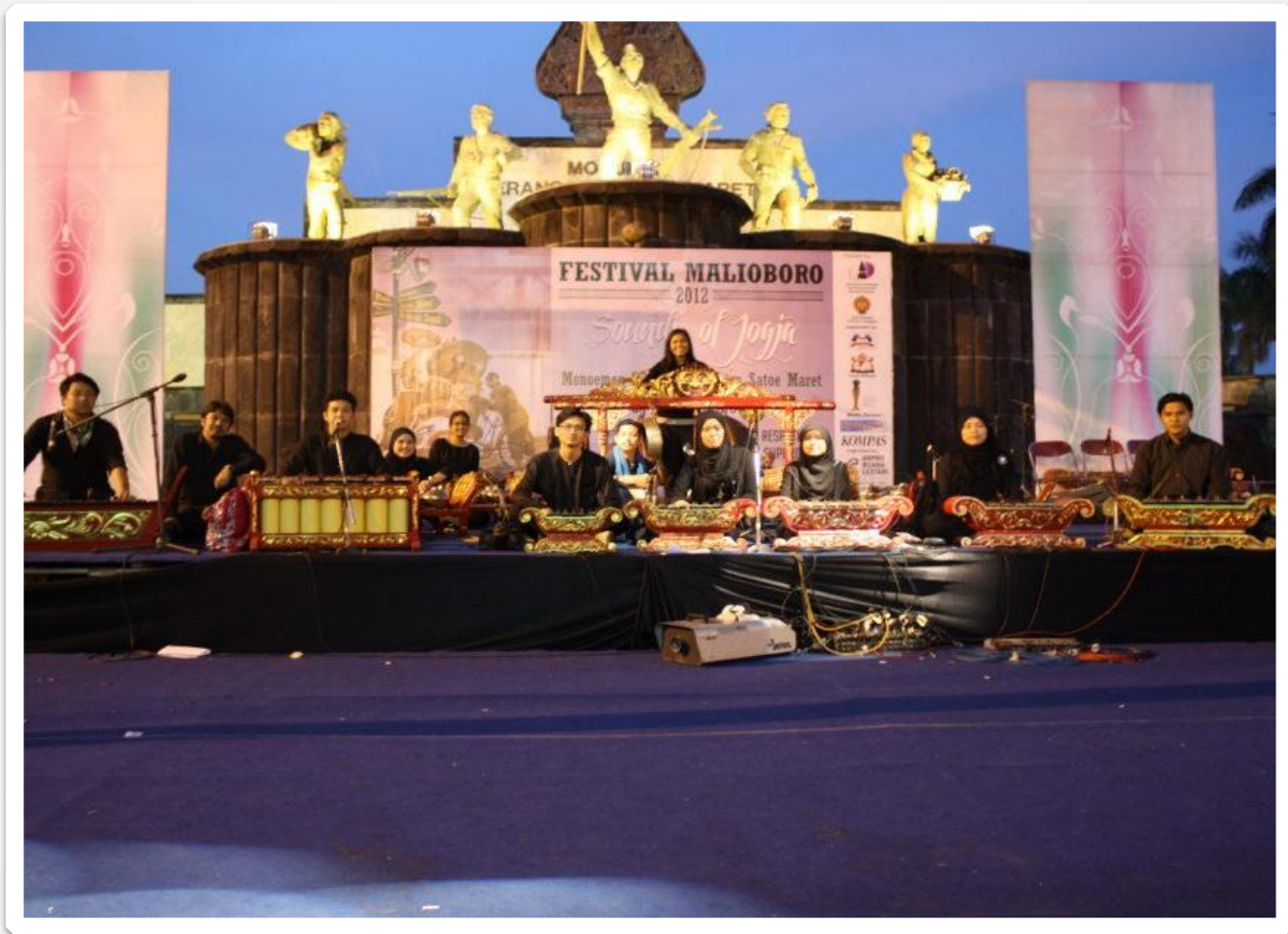
Maliboro Festival, Indonesia, 2012