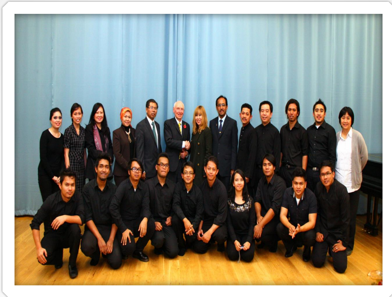
UiTM Performing Group, University of Cambridge (UK),