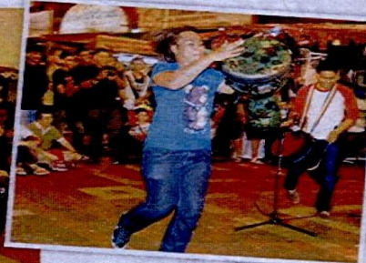
Beat it: A musician beating a traditional drum during the show.