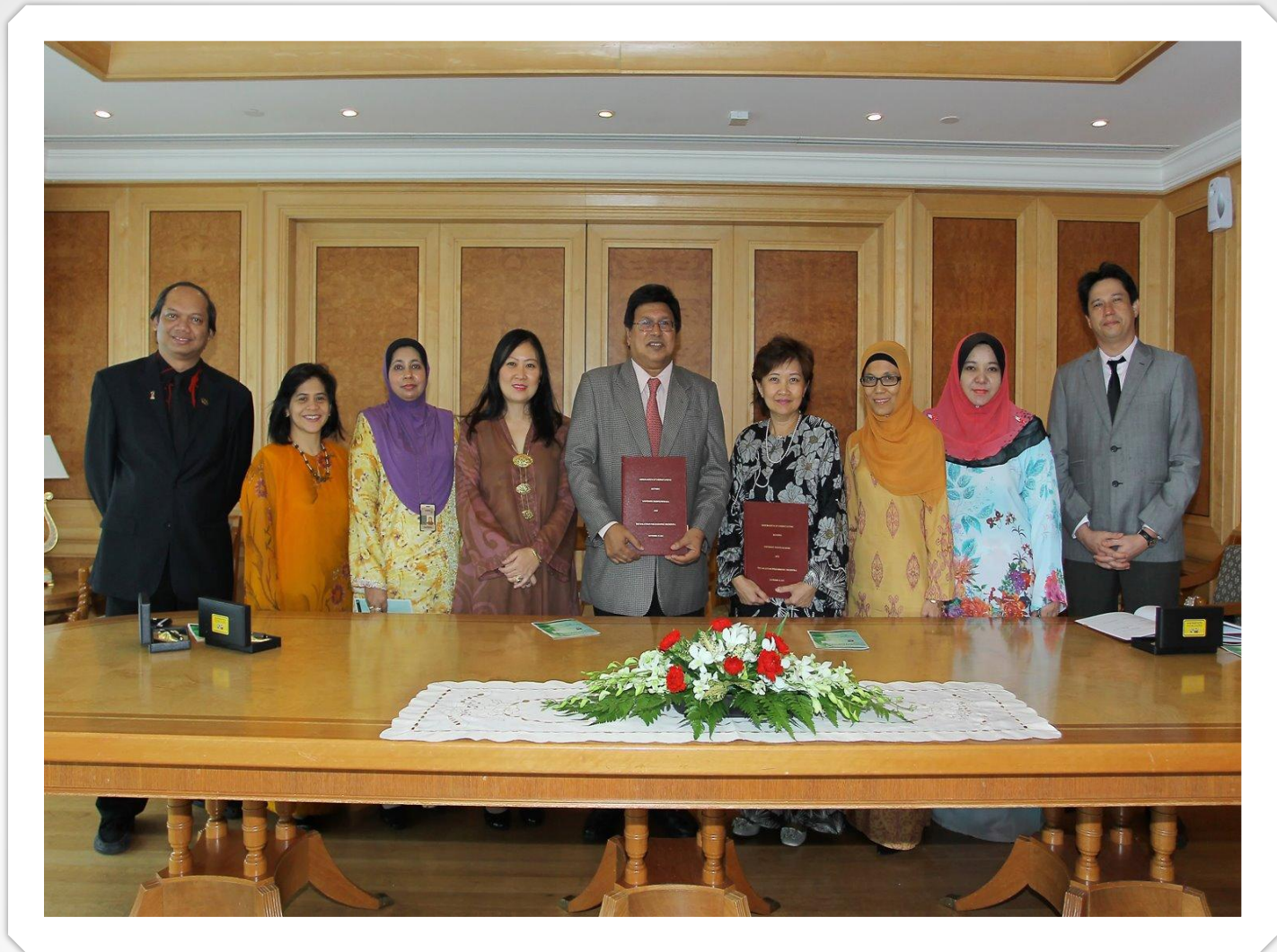
MoU between UiTM and MPO, 2012