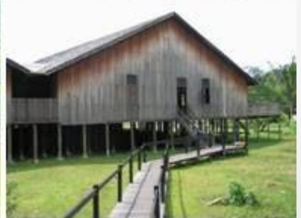
Sarawak Cultural Village