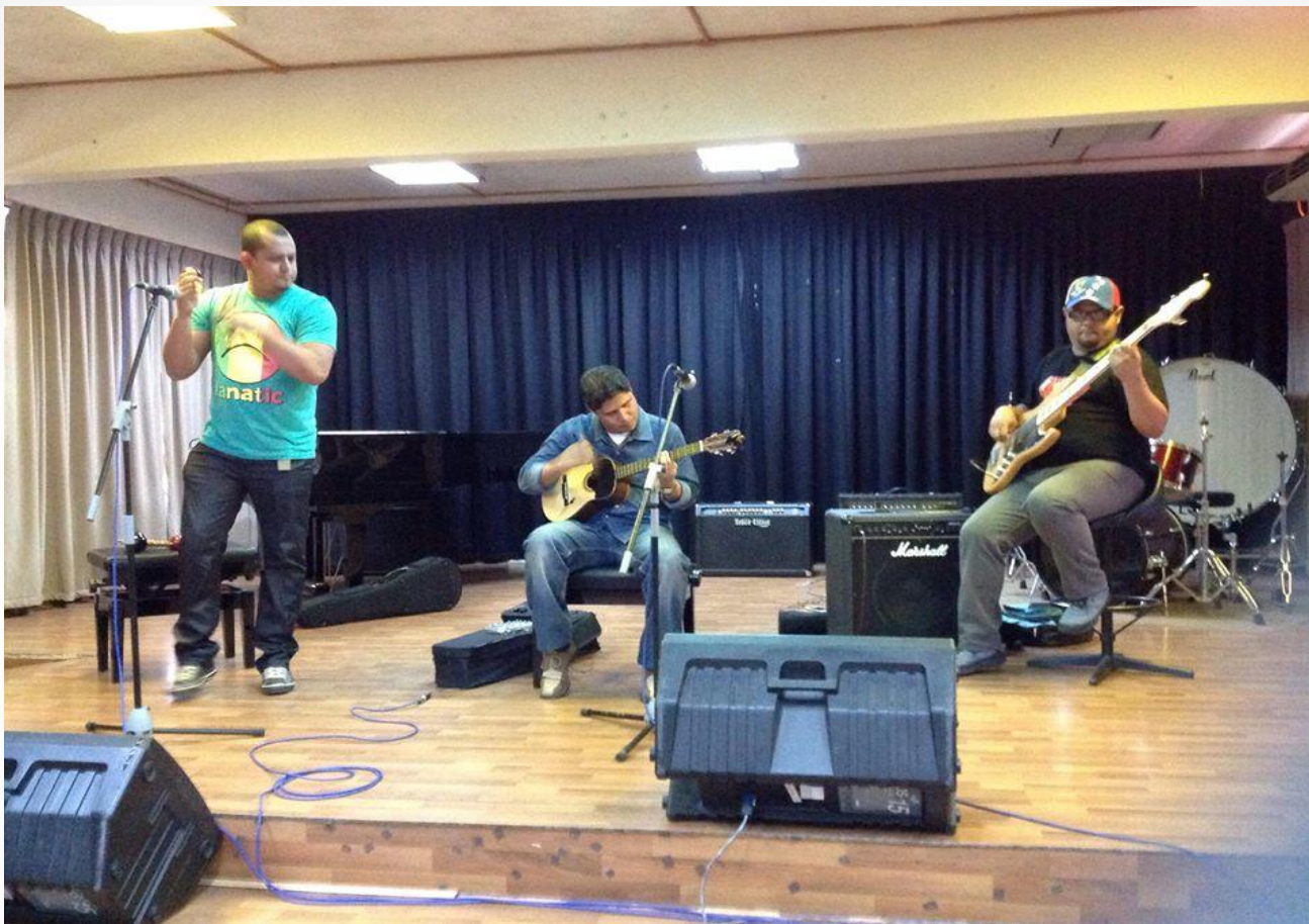
Nelson Gonzalez Trio (Venezuela) Performance and Workshop, 2013