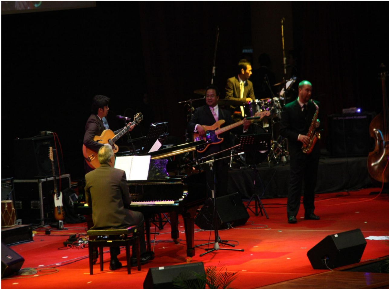
Jazztified Concert, April 2012