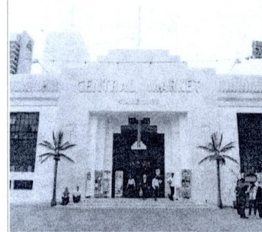
PELAJAR Fakulti Muzik UiTM akan mengadakan persembahan pada setiap Jumaat di Pasar Seni, Kuala Lumpur.