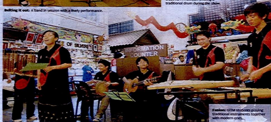
Fusion: UiTM students playing traditional instruments together with modern ones.