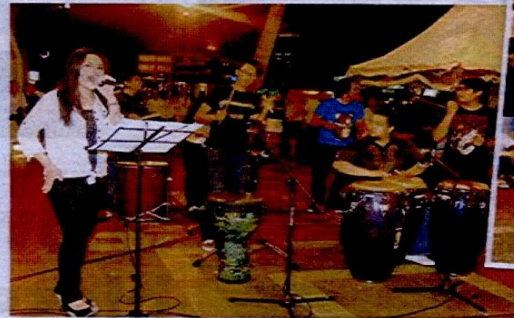
Betting it out: A band in session with a lively performance.

Weekly event at Central Market showcases traditional music