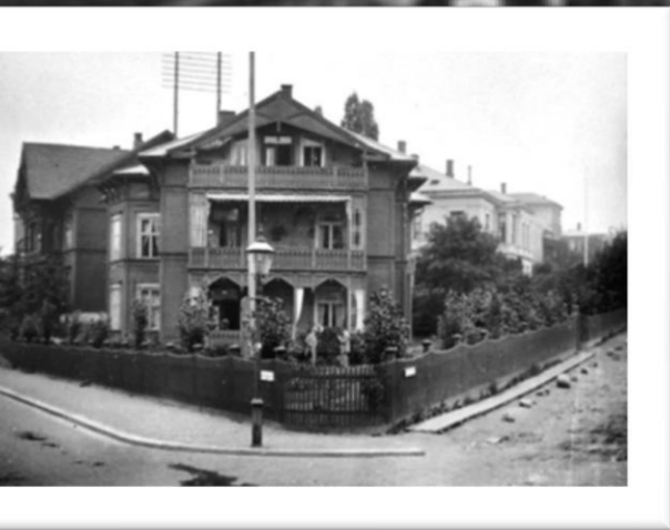
Lyder Sagens gate 2