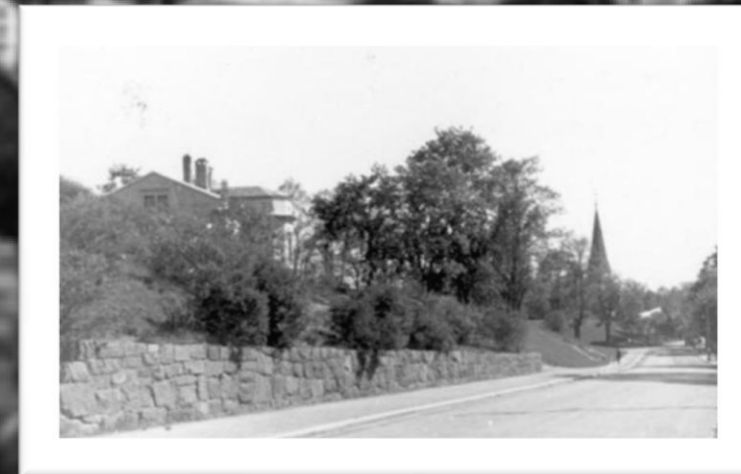
Pilestredet 84B «Prestegården»