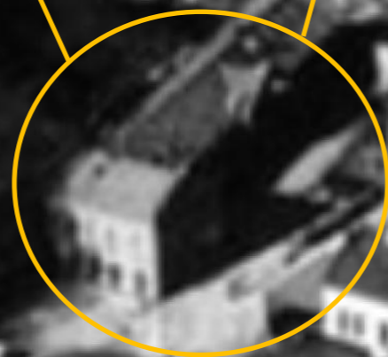
Pilestredet 75c «Norabakken» (Christiania Brødfabrikk)